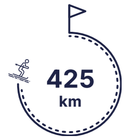
Alpine ski slopes