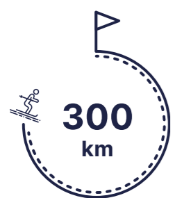
Alpine ski slopes