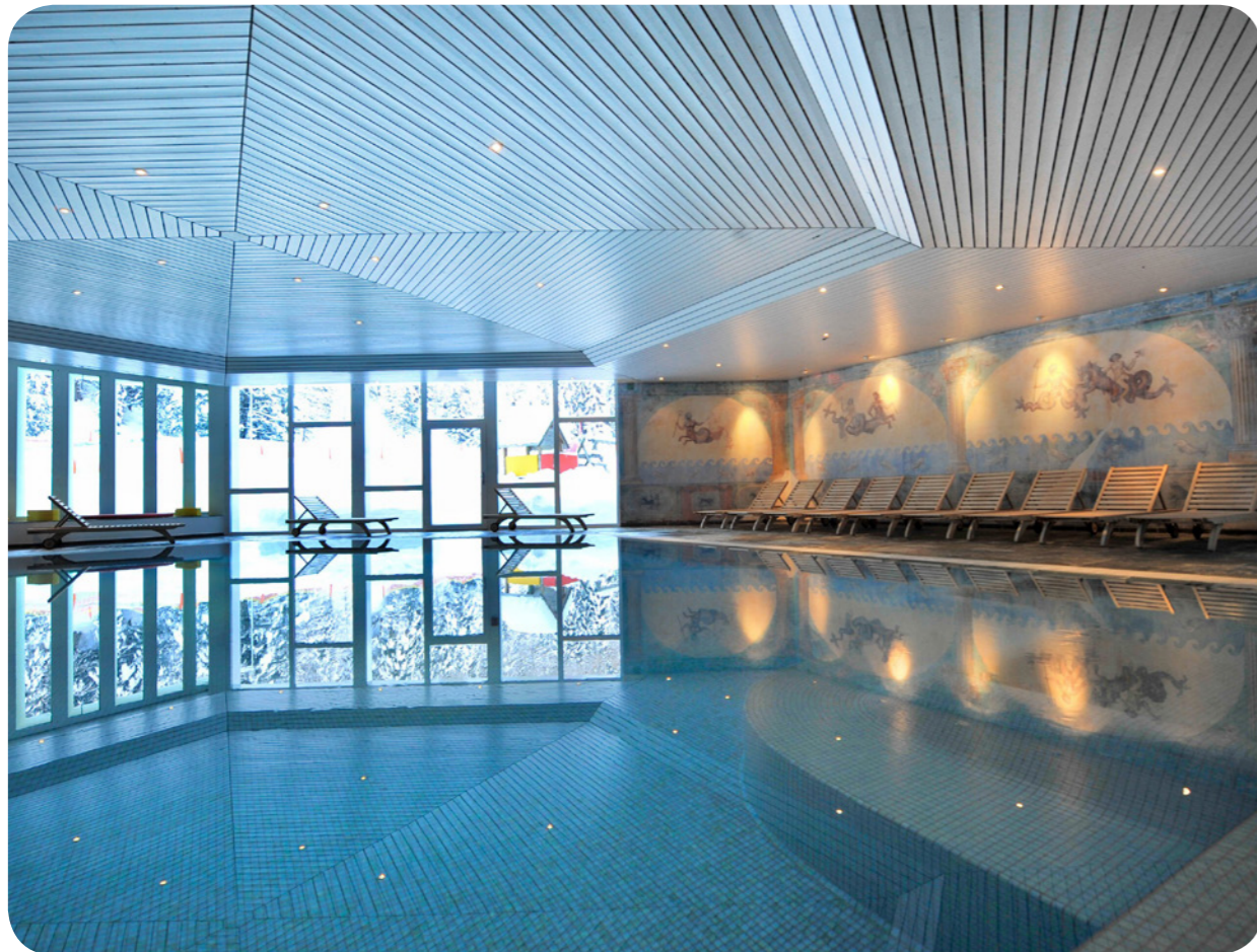
Freshwater overflow pool equipped with teak deckchairs. Children are under the supervision of their parents or an accompanying adult.