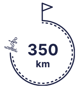
Alpine ski slopes